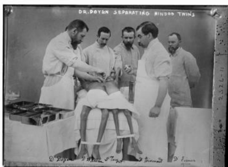
Production photo of an early medical film by Doyen. Image taken from Curtis (2016).

There are exceptions, such as the famous films by Eugène-Louis Doyen, a surgeon who made dozens of films, among others about his operation on conjoined Siamese twins in 1902. His cameraman sold copies of his films for exploitation at the fairground, much to the dislike of his colleagues. Curtis writes (2016): «The cinematic image documents, but it also moves, lending a touch of carnival to even the most boring research film, so film has always crossed that imaginary line between the purely scientific and the spectacular».