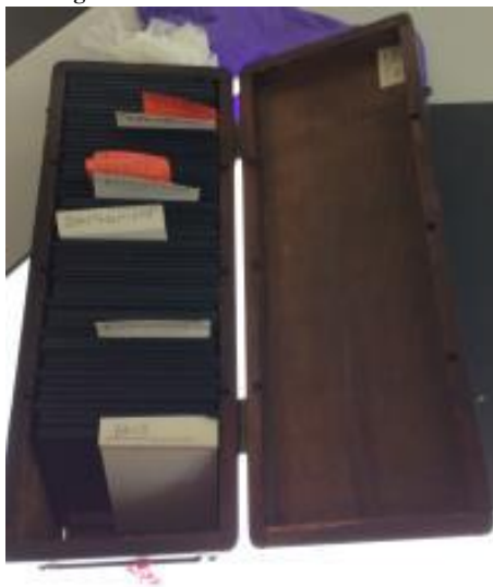
Figure 1. One box of the Nuttall-Collection

The Wellcome Collection 5 library holds two wooden lantern boxes, comprising 133 lantern slides, used by Nuttall and possibly others in lectures and teaching for Tropical Medicine and Hygiene at Cambridge from 1903 until 1931. The library has catalogued these artefacts as ‘Parasitic Diseases: patients and pathology. Lantern slides’. The slides were produced between the late 1890s to 1929 and are in the UK standard format of 3/4 inch square. The glass slides are fixed with black binding, masked in various ways, mainly using simply cut squares and rectangles, fixed with white text labels and the images on the slides are mostly black and white photographs. The subject matter of the collection covers a series of diseases and occurring deformities identified as yaws, elephantiasis, schistosomiasis, ankylostomiasis, trypanosomiasis (sleeping sickness), malaria and ‘miscellaneous’.