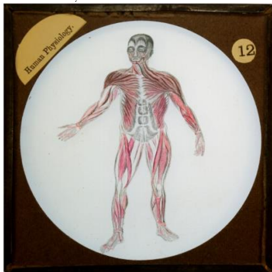
Figure 15. Lantern Slide Nr 12 from the set Human physiology popularly explained: or, the house we live in. c. 1888. York & Son.