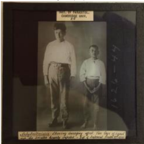
Figure 2. Slides showing different numbers: one on the top label («25») and one written on the cardboard of the mask («1624 – 44»)

The images on the slides are linked to a large number of makers and provenances and it is unclear in which order and in which sub-set they once were presented. A clear indication of a variety of uses and possibly users is the markings of numbers attached to most slides. 92 slides carry numbers and there are four distinctly different types of numbering used across the set. Many slides show more than one number (for example slide eight, topic yaws, in box one labels two numbers: «10» and «Buxton no. 6»).