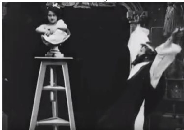
Figure 10. Film still taken at 0:56 from Georges Méliès. The Magician (1898) showing a trick in which a woman appears as statue without legs.

Video version available at < https://www.youtube.com/watch?v=uRKcoD-th0Y >.